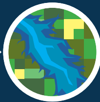
Understand climate risks