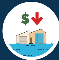
Estimate costs of risks and benefits of protection