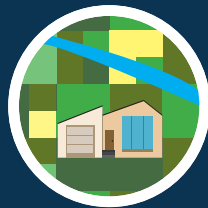
Digitally map your area