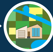
Invest in solutions